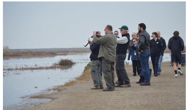
HASBA Board Members

You can view their draft Hayward Shoreline Master Plan - Adaptation Strategies by searching the online HASPA site: www.hayward-ca.gov/your-government/boards-commissions/HASPA . And don't forget the October HASPA meeting.